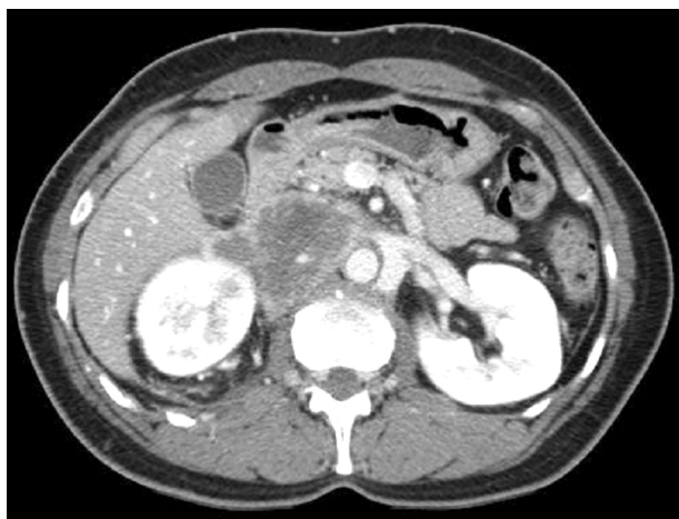
Fig. 1. The abdominal computed tomography scan shows an intracaval leiomyosarcoma infiltrating the right kidney and liver.