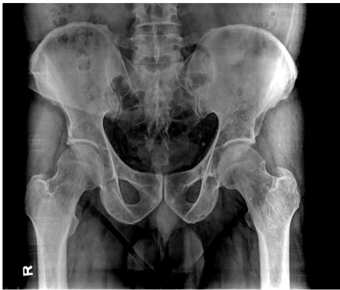
Figure 1: Radiographic examination of the pelvis with both hips image of a 44-year-old male at the time of presentation, with 4 weeks of left hip pain showing localized osteopenia in the left neck of the femur extending into the intertrochanteric region.

diagnosis (TTD). Despite the myriad strategies available to evaluate this hip disease, radiographs remain the common and first-line method of evaluation. Although TOH presents with radiological features such as subchondral cortical loss and osteopenia involving the femoral head and neck in radiographs, the features are not always present in all the patients of TOH who present early. However, magnetic resonance imaging (MRI) helps in the early identification of the disease with features such as bone marrow edema involving the femoral head and neck, even extending to the intertrochanteric region without findings of osteonecrosis. Other signs such as