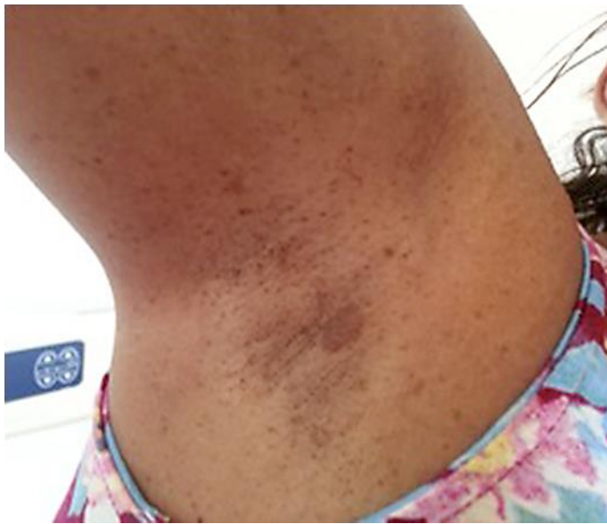
Fig. 1. Ephelides and café-au-lait spots in the axillary region.