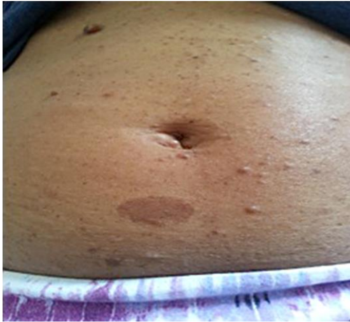
Fig. 2. Café-au-lait spots and neurofibromas in the umbilical region.