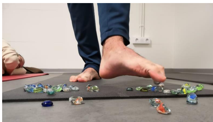
Figure 1. Picking up small glass stones using toes and depositing the stones elsewhere.