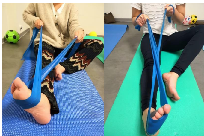
Figure 2. Inversion and eversion resistive movement with an elastic band.