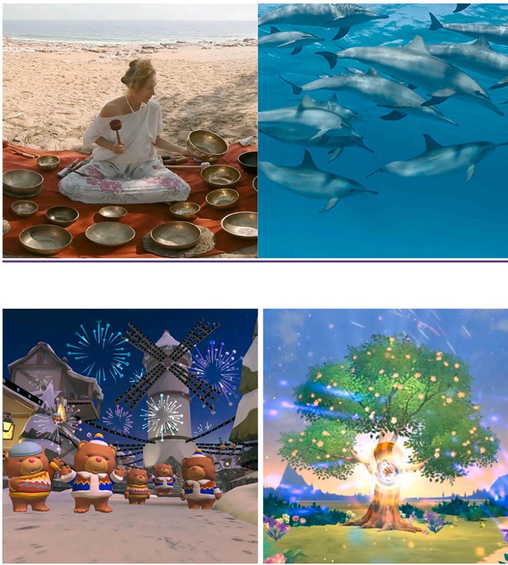
Fig. 2. Sample backgrounds of VR modules offered. Upper left: “Tibetan singing bowl,” Upper right: “Swim with dolphins,” Bottom left: “Bear blast borealis,” Bottom right: “Breathing life.”