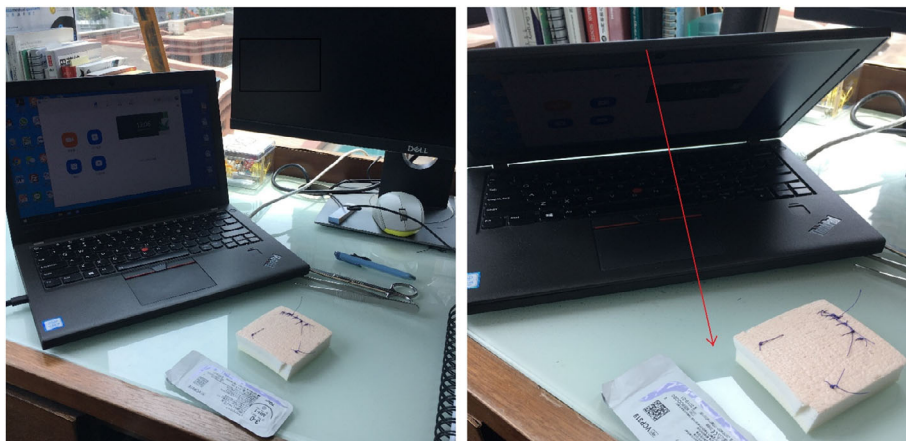
FIGURE 4 Setup of the computers and camera at student's home (Arrow illustrating the viewing angle of the camera to focus on student's hands during surgical skills assessment)