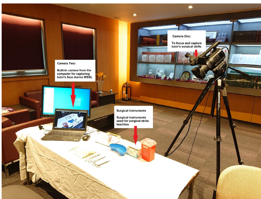
FIGURE 1 Setup of the cameras and computers on tutor's side

Thirty students were recruited into the study and responded to the questionnaire. There were 16 female and 14 male students, median age was 23 (Range 22-24). All students were undergraduate final year