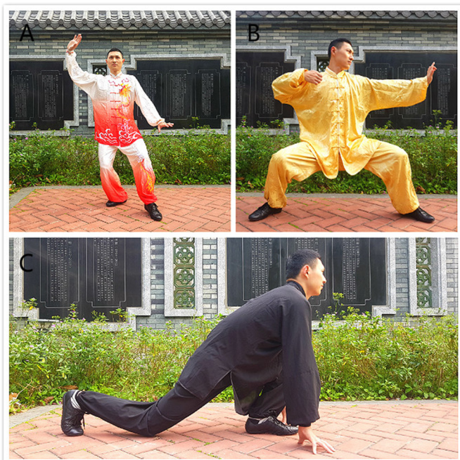
Figure 1 Traditional Chinese exercise (A is tai chi, B is baduanjin and C is yijinjing), and the pictured individual has provided consent for publication of their image.

exercise-based CR, which has been recommended by American Heart Association guidelines, 11 is a safe option. It has been reported that light to moderate intensity physical activity can reduce CHD mortality. 12