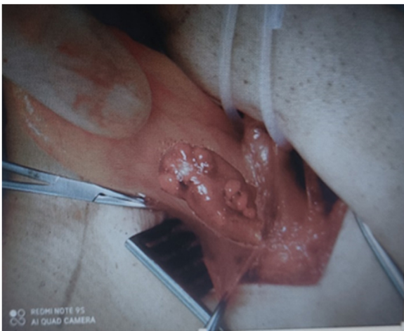
Fig. 1. Appendix inside the hernia sac.