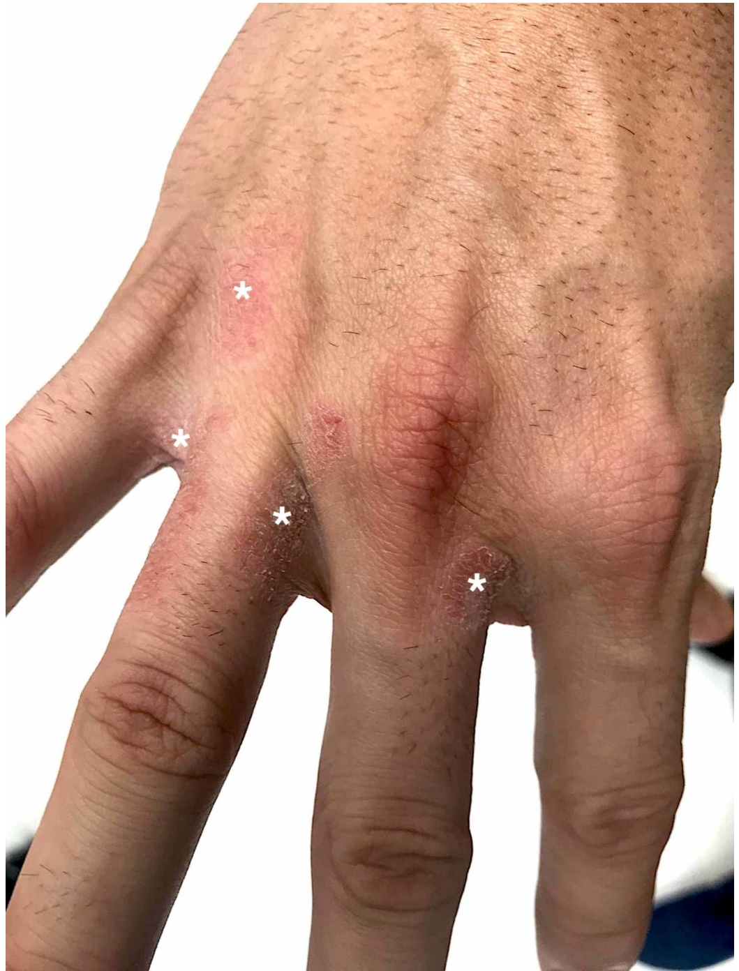
FIGURE 1: Clinical characteristics of irritant contact dermatitis in a 38-year-old patient who adopted frequent hand washing habits a month ago, as a preventive measure for COVID-19 spread, without using moisturizers.

The white asterisks (*) highlight several ill-defined, xerotic (dry), erythematous scaly patches on the dorsum of the hands, fingertips, and finger webs, which progress to lichenification (skin thickening).