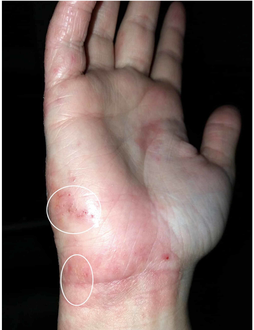
FIGURE 3: Clinical features of allergic contact dermatitis.

The patient initiated preventive hand washing measures two months ago, without hydrating the hands afterward and developed severe skin dryness, fissuring (white arrow), and scaling. Also the irritant-induced changes have progressed to hyperkeratosis and acanthosis (black arrows), highlighting the cumulative exposure.