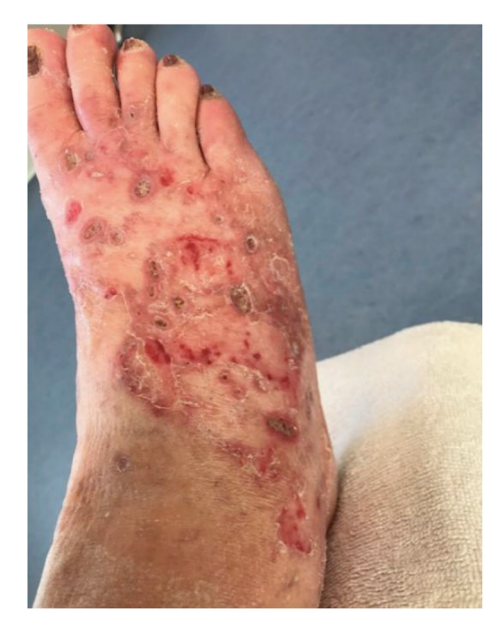
Fig. 1. Violaceous, haemorrhagic and scaly erythematous skin with deep sores. Right foot.