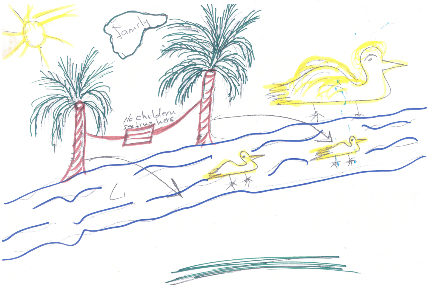
Fig 3. Drawing containing journey metaphor.

Regardless of the main focus of the drawings, many included cultural and religious symbols. While cultural symbols such as the hijab and words written in the participants native language were used to reinforce self-identity in the drawings, religious symbols such as the Quran and praying mats were also used to describe the great sense of comfort participants derived from