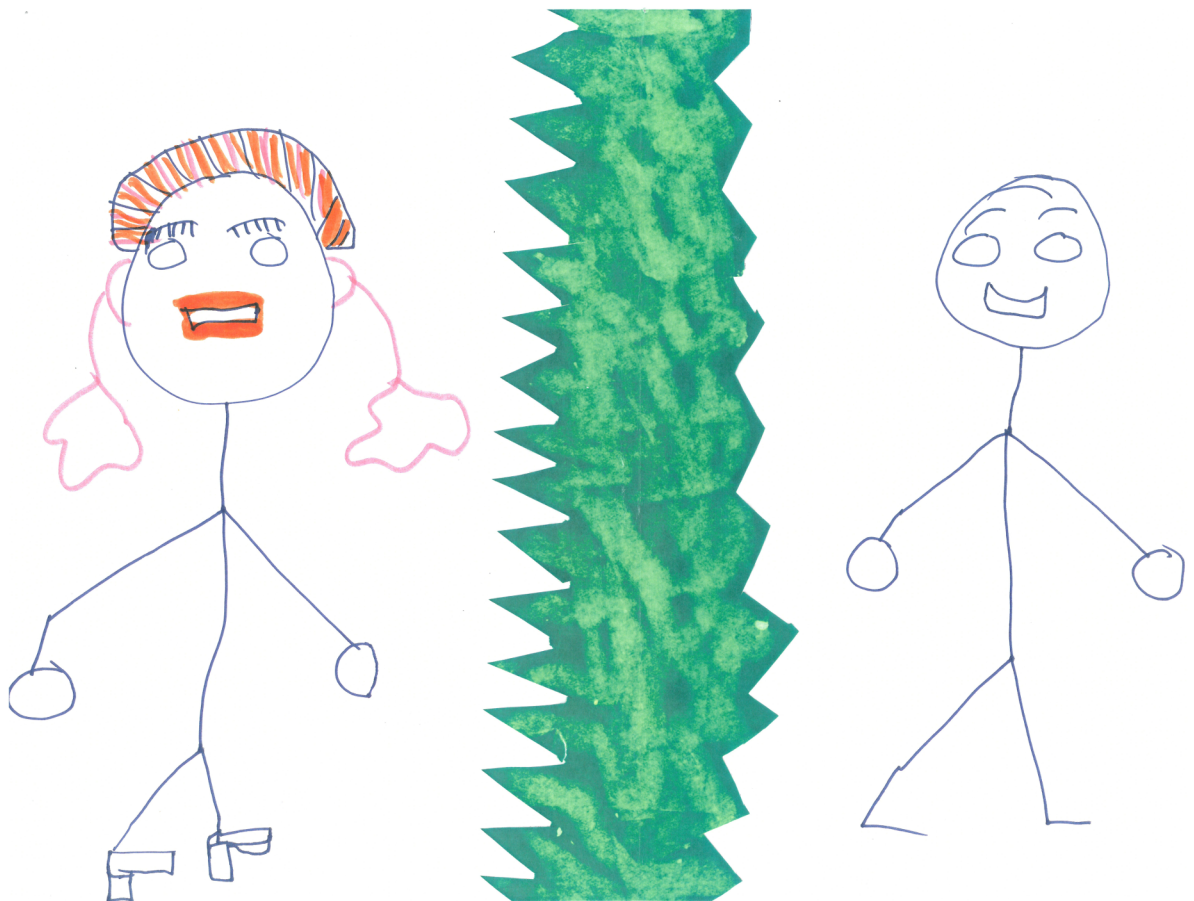
Fig 2. Drawing containing rift metaphor.

- This is the community [...] and there's like family, friends, schoolmates, in-laws. So this is me here, [...] there is this unconscious divide between, this rift valley existing in terms of the stereotypes that they think about you, the stigma that they think you have, a problem. And in the concept, it's that they expect that it should be why your self-esteem, but when they see you