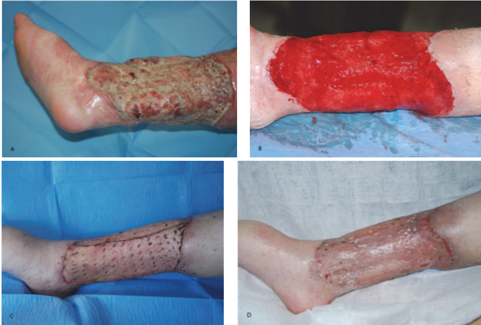
FIGURE 4: 45-year-old patient affected by chronic infected lower limb ulcer. (A) Recovery time (cultural examinations were positive for Pseudomonas aeruginosa and Enterococcus faecalis ); (B) after surgical debridement and antibiotic therapy (cultural examination was positive for Pseudomonas aeruginosa ); (C) 7 days after meshed skin graft with NPWT; (D) 1 month after surgery.