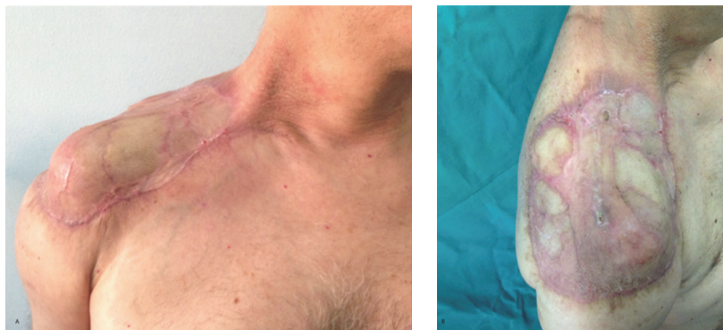
FIGURE 3: Postoperative results. (A) Anterior view 3 months after surgery; (B) lateral view 3 months after surgery with no signs of infection.

weeks of treatment only an average pain reduction of 1.04 points was reported, quite insignificant in comparison with the 2.13-point reduction after the first week of SG+ treatment ( p < 0.0047 ). Another interesting piece of data was the comparison between pain relief after the first phase (mean = 3.39) and the second phase (mean = 6.13) with a p < 0.0009 (Tables 1 and 2).