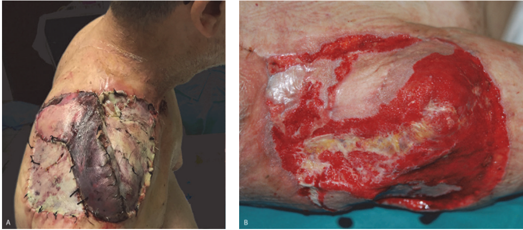
FIGURE 1: 50-year-old patient affected by shoulder sarcoma after tumor excision and reconstruction with pedicled latissimus dorsi flap and skin grafts. (A) Seven days after surgery skin grafts and superficial latissimus dorsi flap necrosis due to Pseudomonas aeruginosa infection. (B) Area 21 days after surgical debridement and NPWT. Cultural examinations of wound continued to be positive for Pseudomonas aeruginosa .