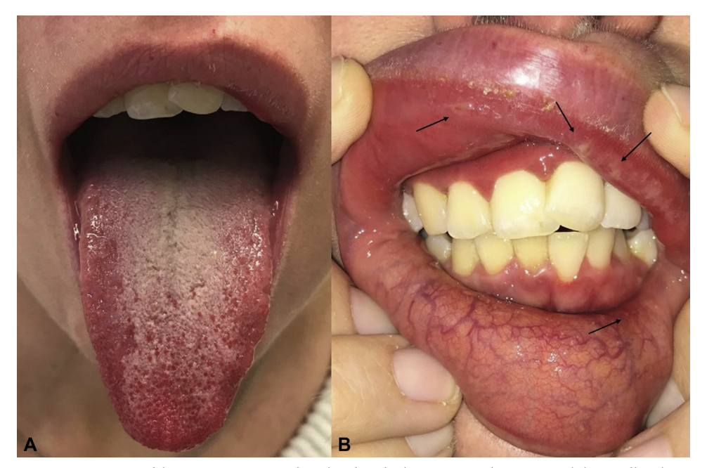
Fig 2. A 37-year-old woman presented with whitish deposits on the tongue ( A ), swollen lips, and herpetiform ulcerations of the lips and gums ( B ).

alternative causative drugs, the absence of infection, and the absence of other inflammatory disease.