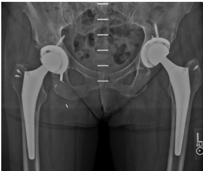
Figure 5. Postoperative pelvic radiograph after bilateral revision total hip arthroplasty, March 2021.

The author(s) confirm that written informed consent has been obtained from the involved patient(s) or if appropriate from the parent, guardian, power of attorney of the involved patient(s); and, they have given approval for this information to be published in this case report.