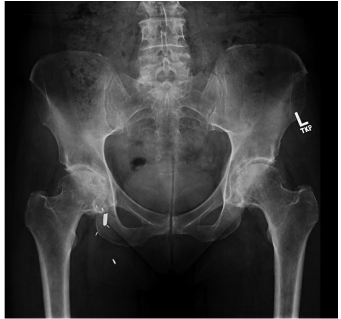
Figure 1. Preoperative pelvic radiograph 2 months after first-stage L-THA, February 2010. Note: Metallic objects seen in the right groin are surgical clips from a remote saphenous vein ligation procedure performed in 1988.

Her postoperative course was uncomplicated, and she was able to walk 2 miles and swim daily by 6 weeks after surgery. Pelvic films at follow-up demonstrated well-fixed and well-aligned