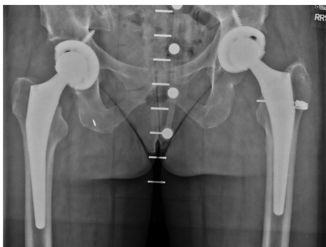
Figure 3. Postoperative pelvic radiograph after staged bilateral total hip arthroplasty, July 2013.

At her 4-week follow-up from the L-THA revision, the patient reported resolution of her neurologic and mood symptoms. At 6 months after L-THA revision, her plasma chromium and blood cobalt levels were within normal limits (2.3 mcg/L and 1.8 mcg/L, respectively).