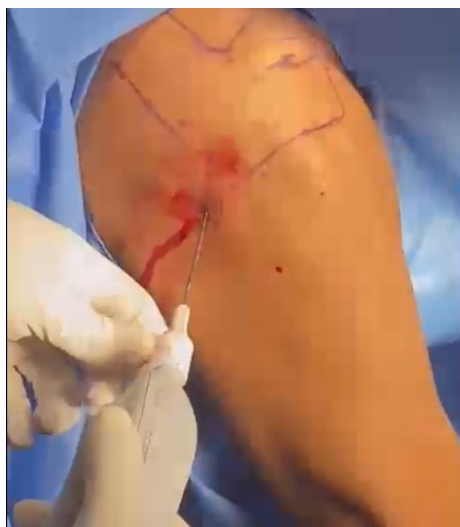
Figure 3: Nanoscope.

Arthroscopy: Bony landmarks of spine of scapula, acromion, clavicle, and coracoid were marked with a marker. Posterior skin infiltration was done around the posterolateral corner. After confirming the effect of local anesthesia, 17-gauge spinal needle was introduced into the joint, at a point 2 cm inferior and 1–2 cm medial from the acromion posterolateral corner. After confirming Intra-articular placement of the needle by injecting normal saline, joint was infiltrated with 10 mL of 0.5% xylocard and waited for 5 min for its action on capsule. A nitinol guide wire was passed through the needle. The needle was withdrawn securing the guide wire. Without making any skin incision, nanoscope was introduced over the guide wire as in Fig. 3 and diagnostic arthroscopy was done. Rotator cuff and labrum found to be normal, long head of biceps was showing mild tenosynovitis.