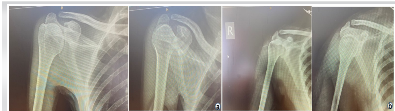
Figure 5: (a) Pre-operative X-ray right shoulder. (b) Post-operative X-rays of right shoulder.

coracoid. After confirming the effect of local anesthesia, 17-gauge needle was inserted just inferolateral to the tip of coracoid process and confirmed its intra-articular position just above the subscapularis with nanoscope. Nitinol guidewire was passed through needle and needle withdrawn. Cannula with its dilator was inserted over the guide wire. The dilator was withdrawn and sharp trocar which was provided along with nanoscope is inserted into the cannula and multiple pokes at different levels were made in the rotator interval capsule under vision like piecrusting of MCL. After removing the trocar, nano punch was inserted through cannula and making use of the pokes made earlier, capsule was cut as in Fig. 4. With nanopunch, middle glenohumeral ligament and anteroinferior capsulotomy were done. A 2.5 mm shaver was introduced and capsule debris was removed (yes, we injected steroid at the end of procedure).