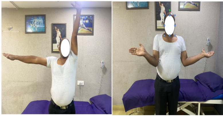
Figure 1: Pre-operative restricted range of movements.