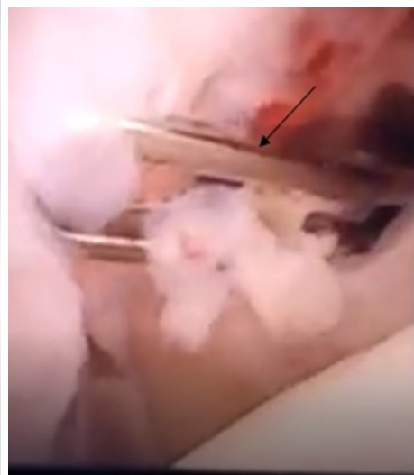
Figure 4: Nanopunch shown by arrow.

Anterior skin infiltration was done around the lateral margin of tip of