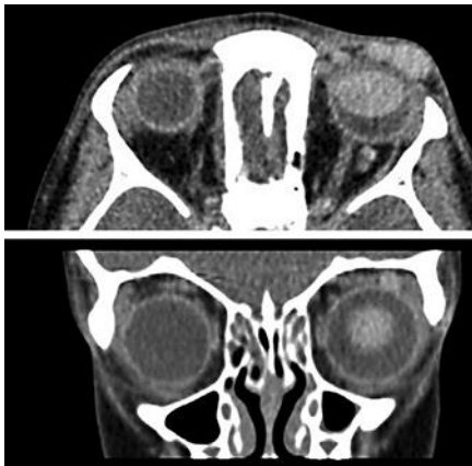
Fig. 1. Top: the orbital computed tomography scan in the axial sections shows multiple well-defined isodense masses with silicone oil in vitreous, in the upper eyelid and intraconal spaces of the left eye. Down: another isodense mass with silicone oil is presented in the coronal plane of the left eye between the superior and lateral rectus muscle.