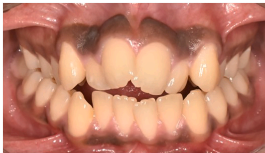
Fig. 1. Pre-treatment intraoral frontal view of occlusion.

The patient was scheduled for SARPE. The bonded HYRAX appliance was constructed. A day before surgery, an appliance trial was conducted. The appliance was checked for proper fitness and any discomfort.