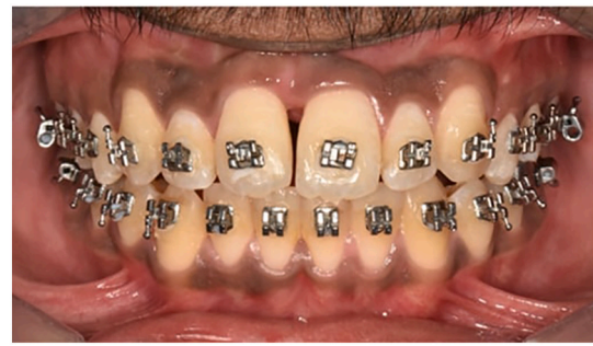
Fig. 5. Post-treatment intraoral frontal view of occlusion.

control as compared to banded HYRAX [9]. The distraction started 4 days after surgery once the callus bone was formed and the rate of expansion was 2 turns per day (1 mm per day). The literature is unclear about the activation schedule, so the rate of distraction osteogenesis has been recommended in this study.