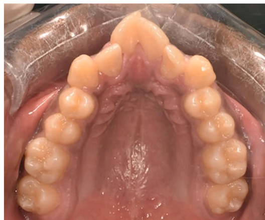
Fig. 2. Pre-treatment intraoral maxillary occlusal photographs.