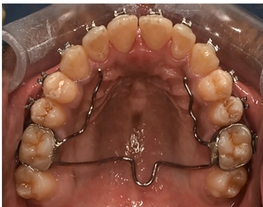
Fig. 4. Post-treatment intraoral maxillary occlusal photograph with brackets and retainer in situ.

The zygomatic buttress and the pterygo-maxillary junction are considered as the critical areas of resistance for maxillary expansion. Therefore, subtotal lefort-1 osteotomy, paramedian split, along with palatal distraction, is a widely used surgical technique [6]. Literature claims lefort-1 osteotomy in combination with palatal distraction results in more displacement and less stress in the maxilla [7]. During surgery, an osteotomy cut is given along all the lateral support of the maxilla followed by a mid-palatal split. For palatal distraction, the tooth-borne appliance HYRAX was used. Recent randomized controlled trial (RCT) has shown comparable effects of both tooth-borne and bone borne distractors [8]. Bonded HYRAX has shown beneficiary effects over vertical