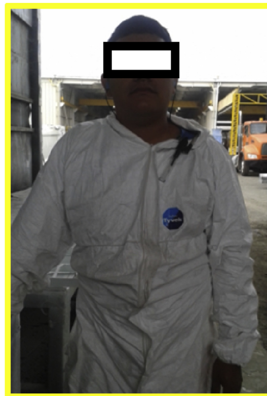
Fig. 1. Sampling train worn by the worker.

In relation to the control of the exposure to solvents through the supply of PPE, it is important to document 100% adherence to its use. Decharat [7], Caro and Gallego [5], and Palma et al [10] reported an adherence of \sim 77\% in their studies. In the companies studied, there were no observations aimed at verifying the use of PPE by workers. Therefore, the actual percentage of adherence could not be corroborated. The companies dedicated to these tasks must have adequate programs of respiratory protection and strict controls on the use and replacement of equipment of personal respiratory and body protection.