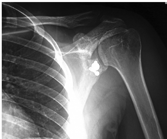
Fig. 4. X-ray AP view of the shoulder at 3 months postoperation showing consolidated coracoid graft.

patients with an engaging Hill Sachs lesion. It is recommended that Hill Sachs lesions involving up to 25% of humeral head may be left neglected, but if engaging, concurrent open/arthroscopic remplissage is generally the accepted treatment. 2,13,14 Abdelhady 2 has reported good outcome with his experience of performing open remplissage of Hill Sachs lesion with infraspinatus tendon in four such patients which had been left unreduced for 10–20 weeks. In defects more than 25% but less than 40%, anatomic