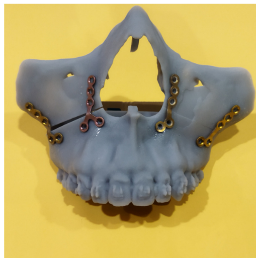
Figure 2. The intraoperative fixation plates were prebent on a 3D-printed stereolithographic model of actual anatomical size. The precise matching of the screw holes and fixation plates provided guidance for the intraoperative jawbone repositioning and orientation.