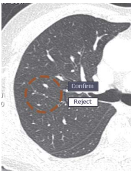
Fig. 3. Example of false-positive detection by computer-aided diagnosis due to mucus within bronchus.

There are several ways to use CAD: as a first reader, as a second reader and as a concurrent reader. Because the sensitivity of the current CAD systems is not quite good enough, if radiologists only reviewed the CAD marks, then many nodules can be missed. So, this option of using CAD as a first reader cannot be considered for clinical practice at this time. As a concurrent reader (reading the CT scans with CAD marks displayed), it may be able to help save time,