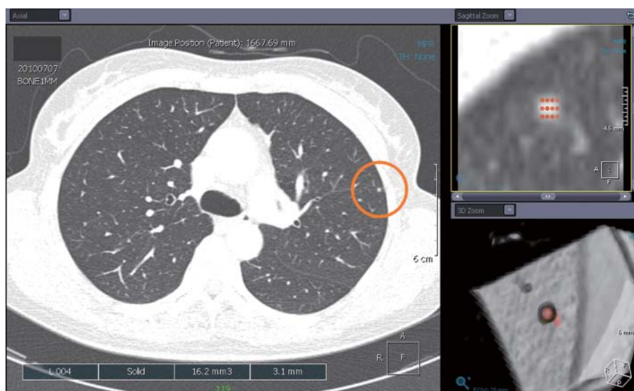
Fig. 1. Snapshot of computer-aided diagnosis output for lung nodule. Detected nodule is marked with circle, and information about nodule size is present in bottom of left panel. Magnified views of detected nodule are presented in right panel with color overlay to show segmentation results.

Note. — *Two CAD systems were evaluated using same dataset. CAD = computer-aided diagnosis, No. = number