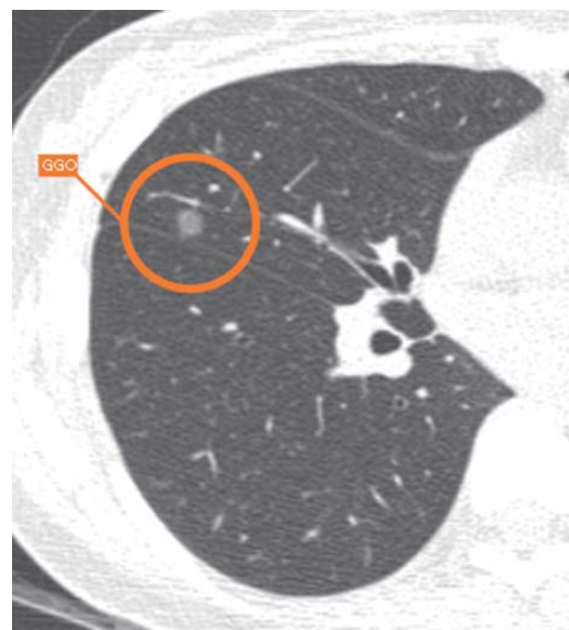
Fig. 4. Example of ground-glass nodule detected by computer-aided diagnosis system.