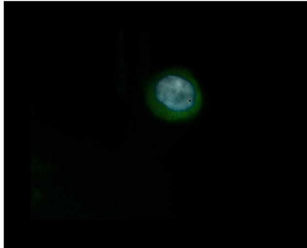
Fig 3. Image of CTC in patient sample using Parsortix. Immunofluorescence microscope showing a CTC in a patient sample with an irregular and larger cell nucleus (Hoechst nucleus staining (blue)) and in comparison lower volume of cell membrane (FITC-CK (green)). Staining for CD45-APC (red) was negative.

https://doi.org/10.1371/journal.pone.0251052.g003