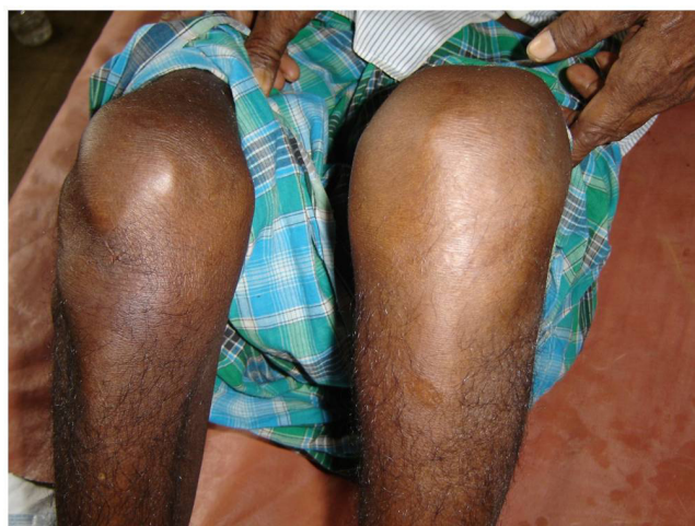
Figure 2 Left knee swelling.

tures was that the patient remained afebrile throughout the course of hospitalization.