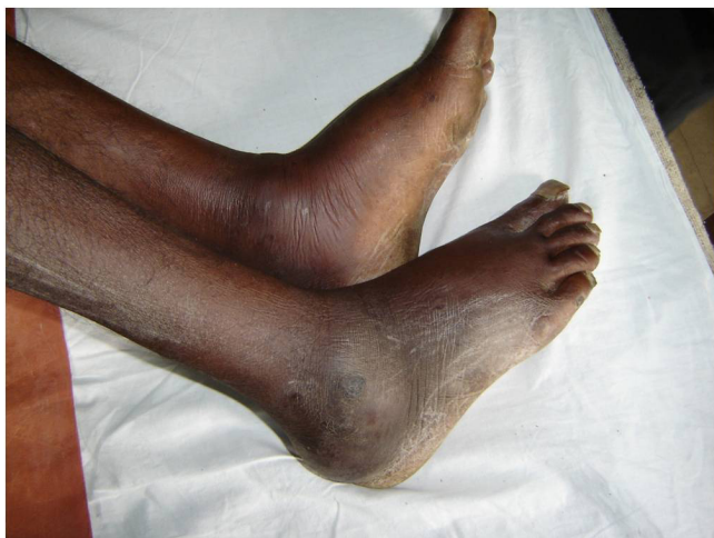
Figure 1 Bilateral ankle swelling.