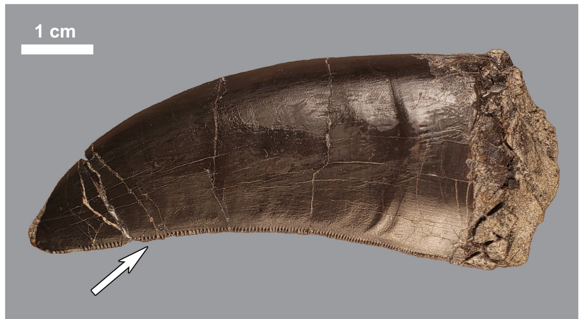
Fig 3. Shed lateral tooth of Allosaurus sp. (MWC 5011) found at the Mygatt-Moore Quarry, white arrow indicates the distal denticles. Mesial denticles are present on such teeth, but were not preserved in this specimen.

Frequencies of bite marks were surveyed from all positively identified skeletal elements (i.e., excluding bone fragments) in each taxonomic group were parsed according to associated nutrient values of a vertebrate carcass. Low economy elements preserve 52.876% of observed