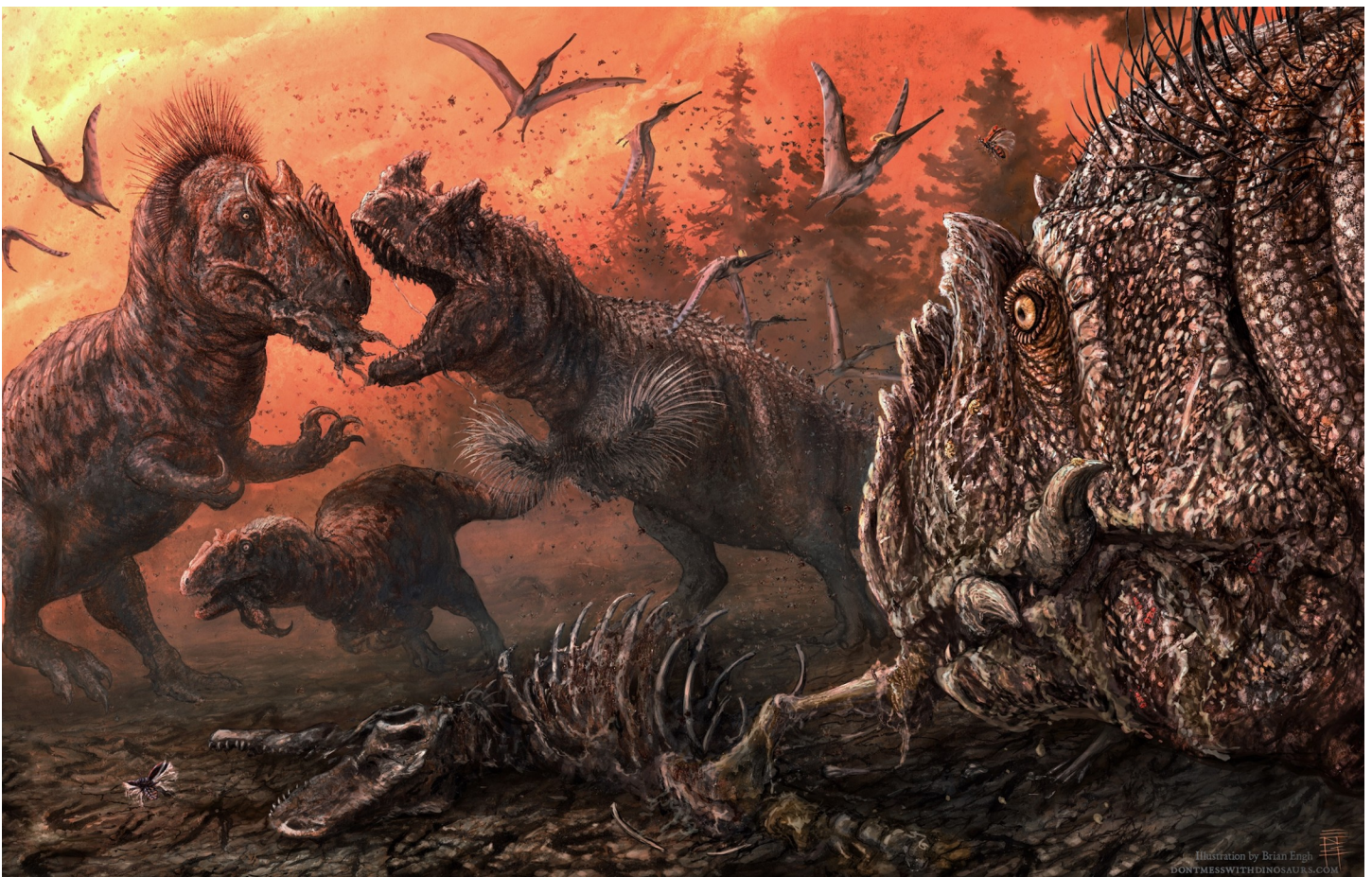
Fig 4. Dry season at the Mygatt-Moore Quarry showing Ceratosaurus and Allosaurus fighting over the desiccated carcass of another theropod. Illustration by Brian Engh (dontmesswithdinosaurs.com).

The Mygatt-Moore Quarry preserves an unusually highly tooth-marked assemblage from the Upper Jurassic Morrison Formation. Bite marks are consistent with a theropod trace maker, and striations place the traces within the range expected for the known large-bodied theropods from the site: Allosaurus and Ceratosaurus . The largest of these traces suggests an individual that is too large to be either taxon based on existing fossils, suggesting they were produced by an even larger taxon such as Saurophaganax or Torvosaurus . While the location of traces on herbivorous dinosaurs are consistent with predation or early access to remains, bite marks found on other theropod material, more specifically Allosaurus , are concentrated on lower-economy bones, suggesting that they represent incidences of scavenging. If the trace maker is Ceratosaurus , this study represents the first incidence of this taxon feeding on another large, contemporaneous theropod. If the trace maker is Allosaurus , this study represents the first time cannibalism has been reported in this taxon and its encompassing clade, Allosauroidae. If