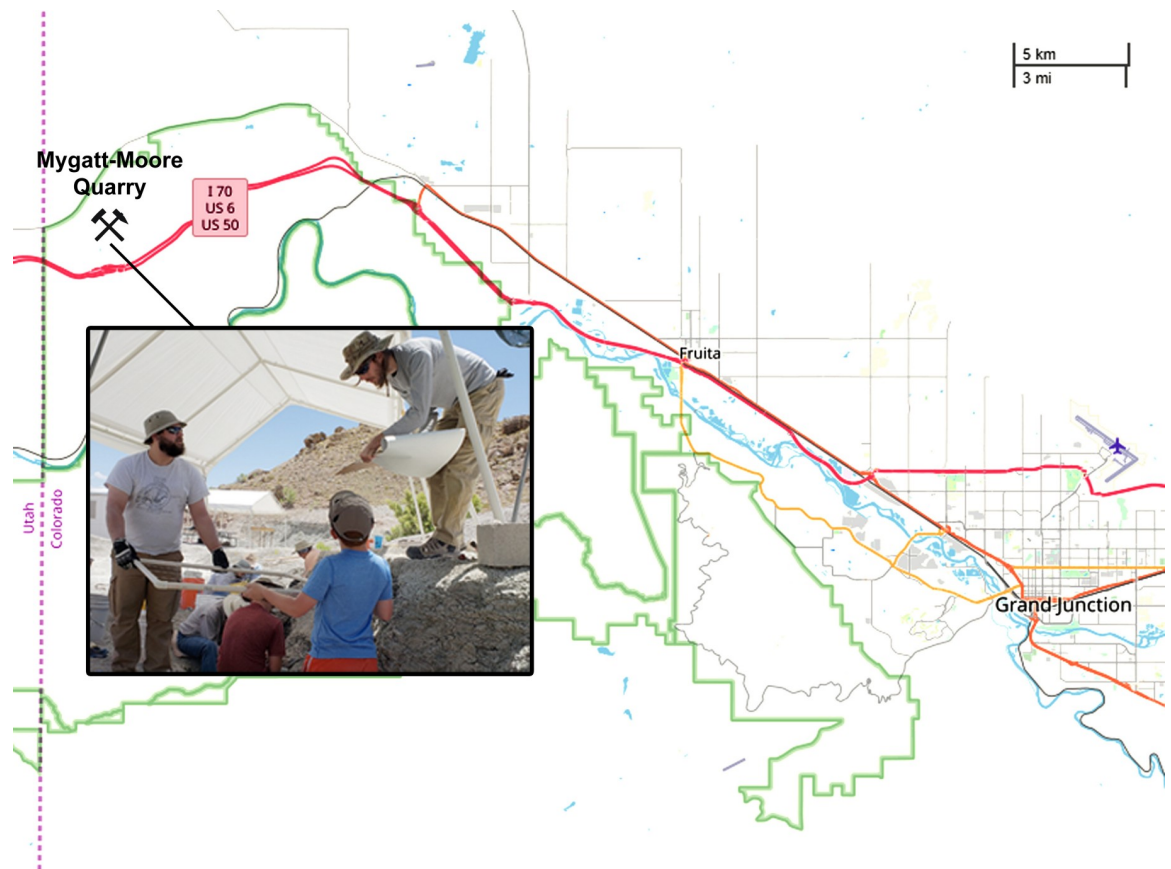
Fig 1. Map of western Colorado showing the location of the Mygatt-Moore Quarry (© OpenStreetMap contributors | https://www.openstreetmap.org/copyright ). Inset photo shows museum field crew and citizen scientists during a public excavation through the Museums of Western Colorado at the Mygatt-Moore Quarry in 2018. The individuals pictured here provided written informed consent (as outlined in PLoS consent form) to publish their image alongside the manuscript.

https://doi.org/10.1371/journal.pone.0233115.g001