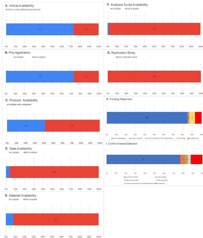
Figure 2 (A) Article availability, (B) pre-registration, (C) protocol availability, (D) data availability, (E) material availability, (F) analysis script availability, (G) replication study, (H) funding statement and (I) conflict of interest statement.