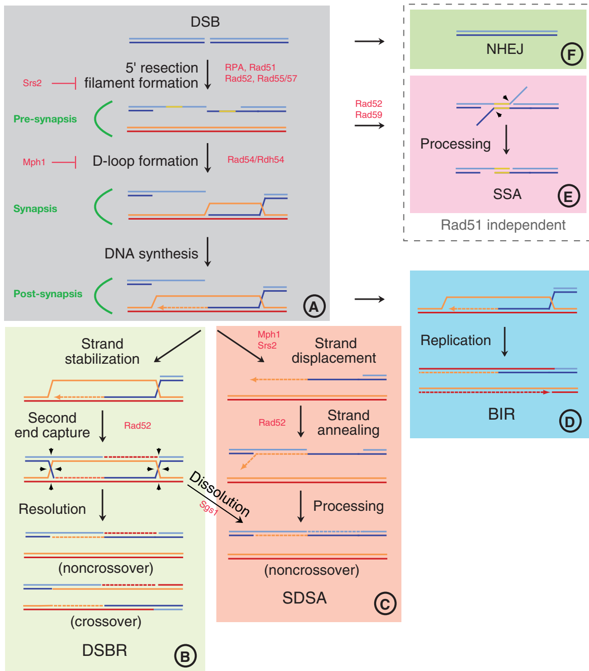
Figure 1. Models for the repair of DNA double-strand breaks. DNA DSBs are resected to generate 3'-protruding ends followed by formation of Rad51 filaments that invade into homologous template to form D-loop structures. (A) After priming DNA synthesis, three pathways can be invoked. In the DSBR pathway, the second end is captured and a dHJ intermediate is formed. (B) Resolution of dHJs can occur in either plane to generate crossover or non-crossover products. Alternatively, dHJs can be dissolved by the action of Sgs1-Top1-Rmi1 complex to generate only non-crossovers. In the SDSA pathway (C), the extended nascent strand is displaced, followed by pairing with the other 3'-single-stranded tail, and DNA synthesis completes repair. Nucleolytic trimming might be also required. In the third pathway of BIR (D), which can act when the second end is absent, the D-loop intermediate turns into a replication fork capable of both lagging and leading strand synthesis. Two other Rad51-independent recombinational repair pathways are also depicted. In SSA (E), extensive resection can reveal complementary sequences at two repeats, allowing annealing. The 3'-tails are removed nucleolytically and the nicks are ligated. SSA leads to the deletion of one of the repeats and the intervening DNA. Finally, the ends of DSB can be directly ligated resulting in NHEJ. (F) Newly synthesized DNA is represented by dashed lines.

the double-strand break repair model (DSBR), the second end of DSB can be engaged to stabilize the D-loop structure (second-end capture), leading to the generation of a double-Holliday Junction (dHJ) [(7), reviewed in Ref. (8); Figure 1B]. A dHJ is then resolved to produce crossover