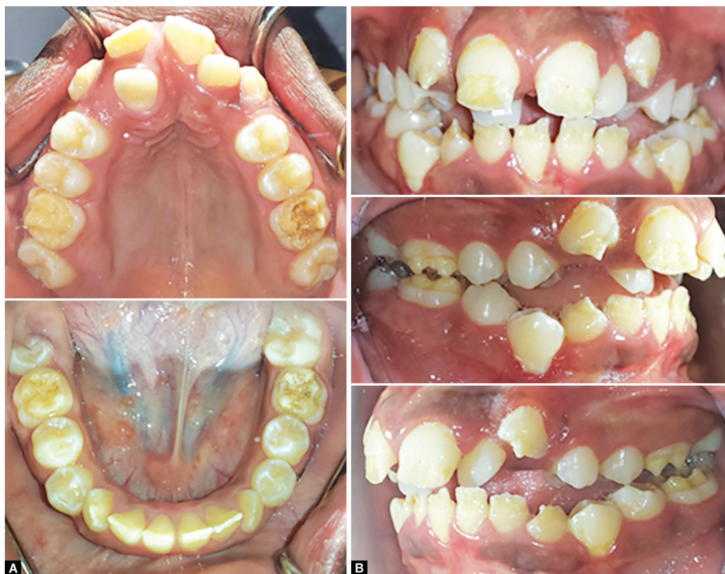
Fig 1A and B: Enamel hypoplasia occurred during early childhood. Enamel formation took place on the incisal third of the maxillary central incisors, maxillary canines, mandibular incisors and canines, and all the first permanent molars. The maxillary lateral incisors are normal