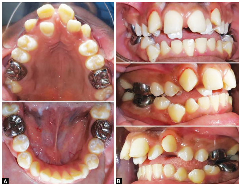
Figs 5A and B: Posttreatment photographs; a composite resin restoration was applied to all affected anterior teeth, and stainless steel crowns were applied to all the first permanent molars

child, as he is only 14 years old, this treatment serves as transitional treatment until he reaches a stage of stable occlusion, then he can go for a more comprehensive approach.