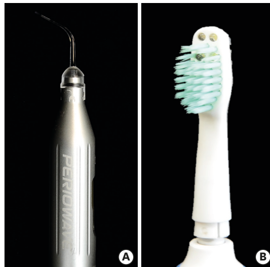
Figure 1. (A) Commercial photodynamic therapy kit, and (B) toothbrush with a light-emitting diode.

for 96 hours at 37°C. An automated counter (IUL) was used to count the number of colony-forming units (CFUs). The percentage of surviving bacteria was calculated by dividing the CFU value on the test-group disks by the CFU value on the untreated control-group disks.