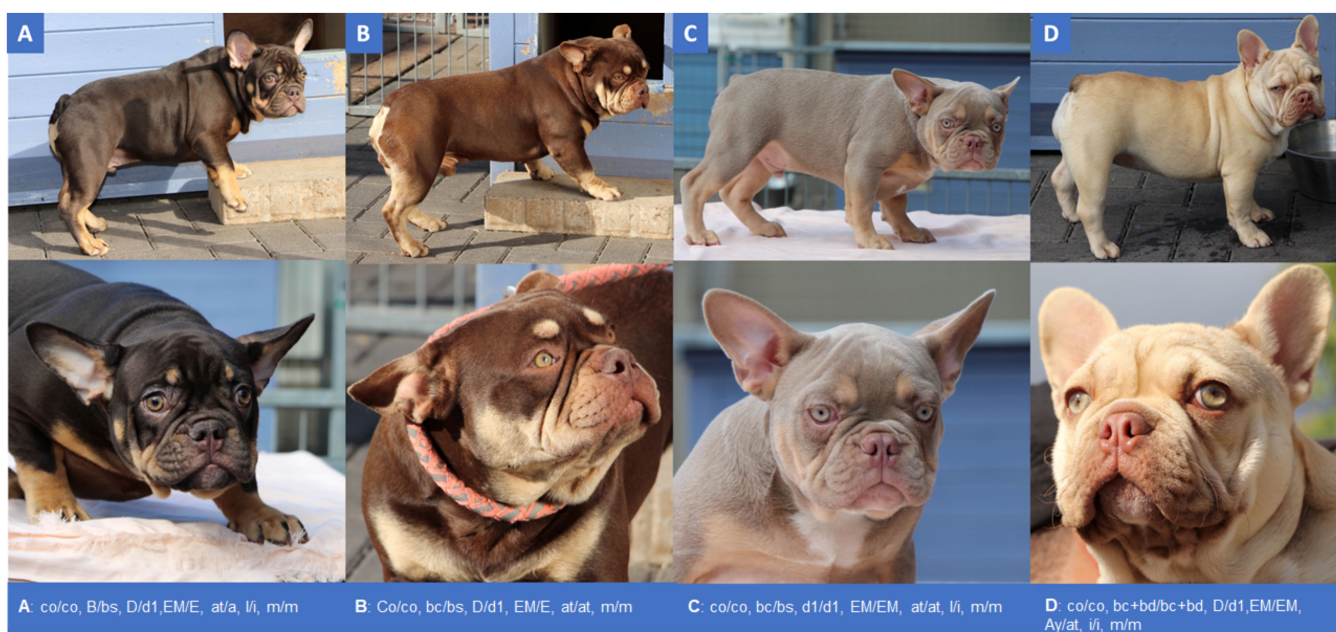
Figure 1. Cont.

We obtained photographs from 20 French Bulldogs with different coat color genotypes, including five co/co dogs (Figure 1, Table S2). We confirmed the earlier observation that the eumelanin coat color in adult cocoa dogs ( co/co ) is of a darker brown shade than the eumelanin coat color in TYRP1 deficient dogs ( b/b ) (Figure 1A,B) [5]. However, the data also illustrate an enormous complexity of additive and/or epistatic gene–gene interactions of HPS3 and TYRP1 with other coat color genes. It is often not possible to deduce the underlying genotype from the phenotype. At the same time, genotyping only the HPS3 gene alone does not allow one to make reliable predictions of the coat color of a French Bulldog. The comprehensive characterization of the coat color of a French Bulldog often requires the genotyping of several coat color loci.