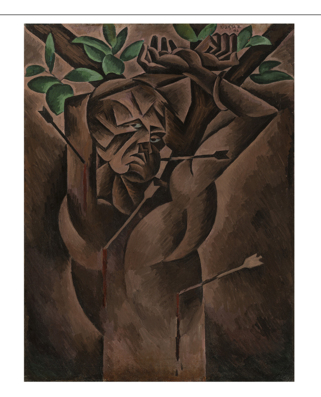
FIGURE 1 | Bohumil Kubišta, Saint Sebastian, 1912. Oil on canvas, 98 × 75 cm. Collection of National Gallery, Prague.

Another key feature emerges when the painting is juxtaposed with the preparatory drawing, in which the painter created an elaborate compositional structure that he later adapted for the oil version (Figure 2). Scholars agree that the saint's head constitutes the compositional and ideographic center of the painting. What immediately stands out is the difference in the most prominent, attention-grabbing visual and affective salience of the two images, which is to say the difference in the way Kubišta rendered the gaze of the figures in the preparatory drawing and the painting. He changed the averted gaze of the figure in the drawing to a direct gaze in the painting, which decisively alters the expression and hence the effect of the two images on the viewer. While in the preparatory drawing, the averted gaze and a half-closed left eye result in the expression of silent endurance and resignation, in the oil painting the gaze is focused on the viewer, which imbues the face with an inquisitive, defiant directness, as if the saint (the artist) is appraising or challenging the viewer, thereby establishing communicative interaction with him/her. Thus, while both the drawing and the painting may share an overall theme and artistic intention, namely to present a visual metaphor of Kubišta's own struggle with the world at large, the semantic difference in the affective affordance of the gaze/expression substantially modifies the meaning in each