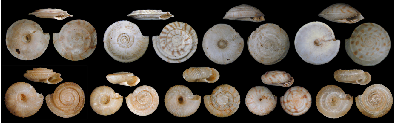
Fig. 4. Recently extinct Endodontidae from Rurutu (Austral Islands, French Polynesia).