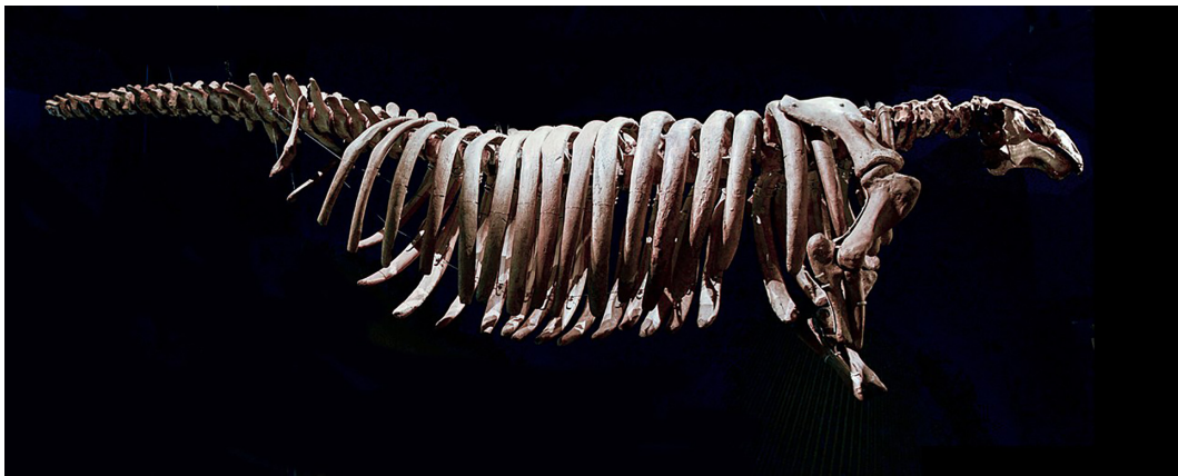
Fig. 7. Steller’s sea cow ( Hydrodamalis gigas (Zimmerman)), one of the few documented marine extinctions, skeleton in the Musée des Confluences, Lyon.

We agree with Roberts & Hawkins (1999, p. 245) that “what is now beyond doubt is that many marine species have