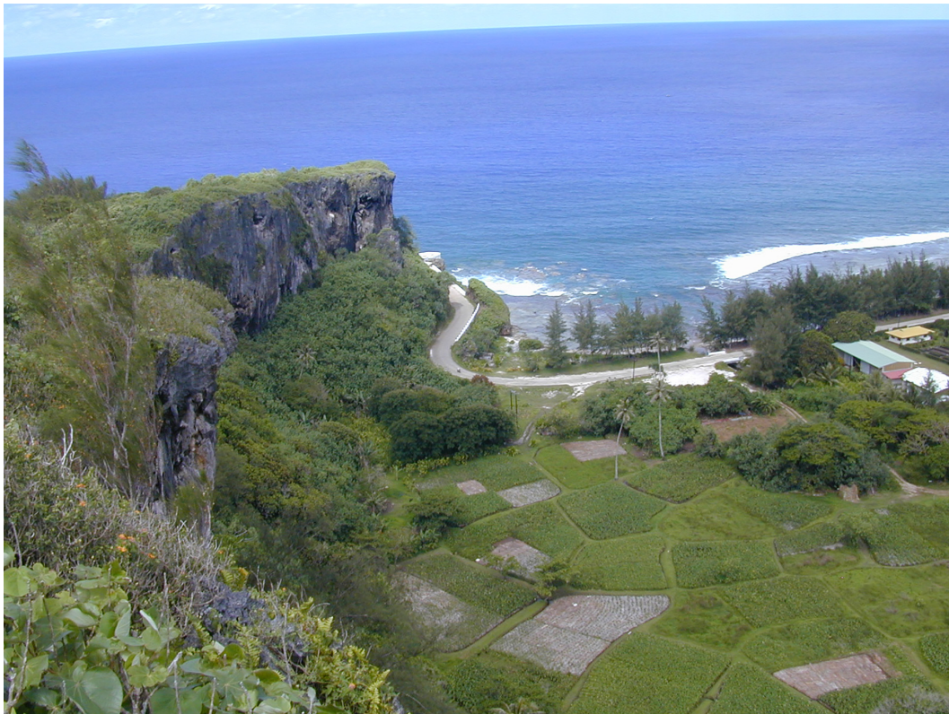
Fig. 5. Rurutu (Austral Islands, French Polynesia) was once home to 19 species of endemic Endodontidae (Mollusca). Despite extensive searches in the remaining patches of native vegetation, such as at the foot of this cliff, only empty shells were found. All 19 species are now considered extinct.

Our most recent numbers (Cowie et al. , 2017) are 638 species extinct, 380 possibly extinct, and 14 extinct in the wild, a total of 1,032 species in these combined categories, and more than twice as many as listed by IUCN (2020) in these categories (462). Furthermore, based on expert assessment of a rigorously random global sample of 200 land snail species (Régnier et al. , 2015a), extrapolation estimated that of the