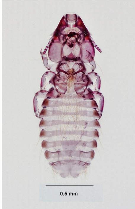
Fig. 3. Parasites, such as this louse (Phthiraptera, Rallicola pilgrimi Clay, collected June 2014, South Island, New Zealand), which went extinct when its host, the little spotted kiwi ( Apteryx owenii Gould), was transferred to predator-free islands (Buckley et al. , 2012), and which is not on the Red List , are almost completely unknown in the assessment of extinctions.

as a whole, based on Red List data, perhaps because higher vagility and concomitant larger range sizes reduce extinction risk in these highly volant groups.