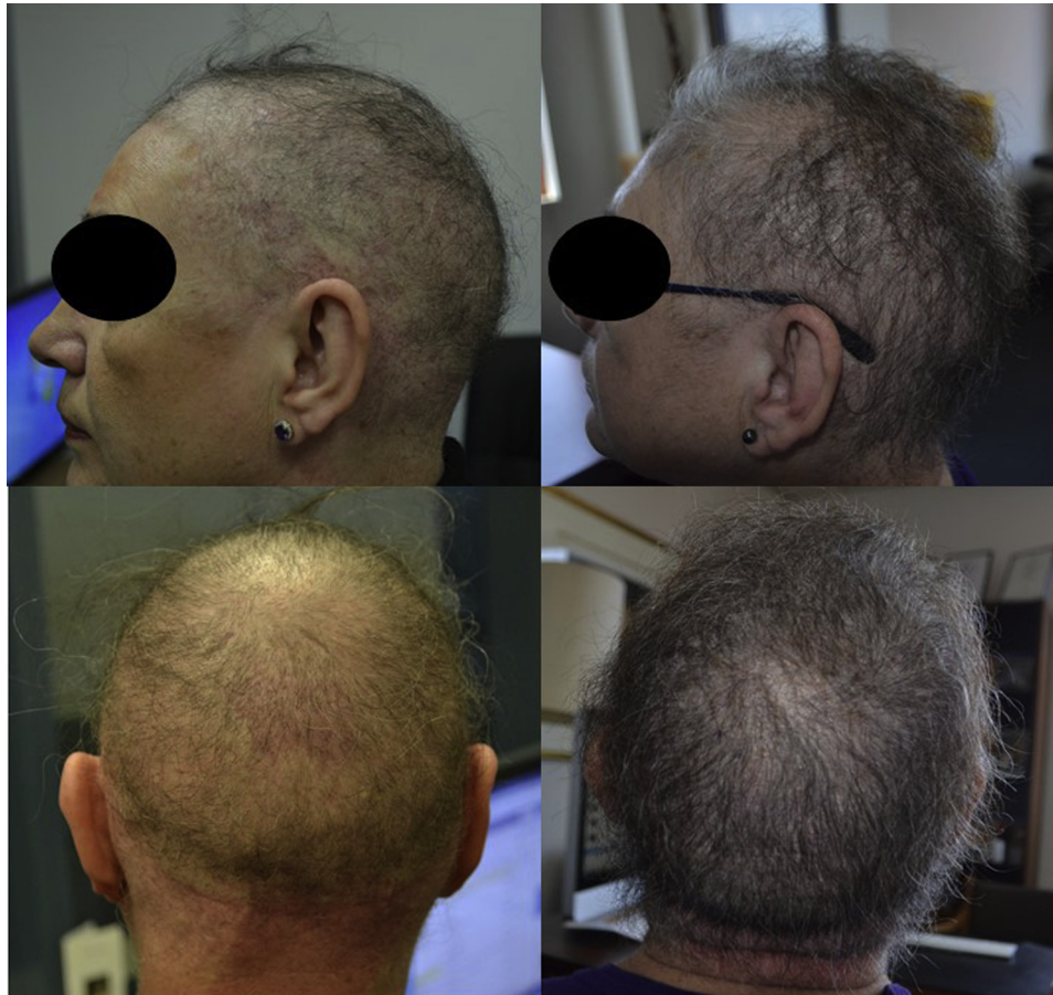
Fig 2. Patient 1. Monilethrix. Lateral and posterior views of the scalp before and after 6 months of treatment with low-dose oral minoxidil.