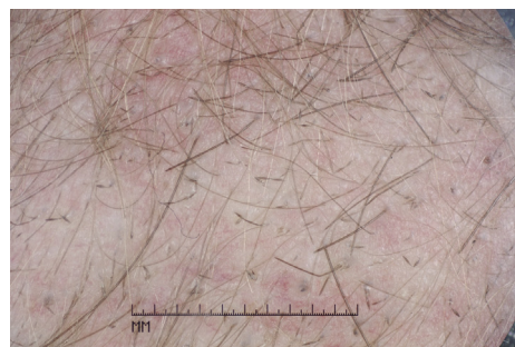
Fig 1. Patient 1. Dermoscopic image of the occipital scalp shows numerous broken hairs. Beaded hairs pathognomonic of monilethrix can be seen.

A 40-year-old woman presented with lifelong fragile, sparse, and thin hair. She had monilethrix