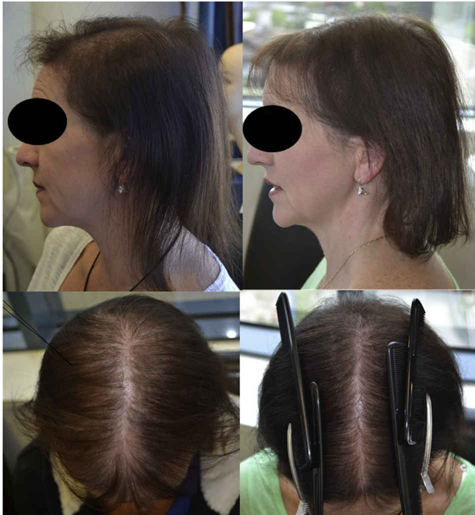
Fig 4. Patient 2 is less severely affected than patient 1. Lateral and mid-frontal views of the scalp before and after 6 months of treatment with low-dose oral minoxidil.

does not improve hair fragility or hair density. 7 Topical minoxidil 2% has been used to treat monilethrix. Saxena et al 8 treated 3 sisters with 2% monilethrix solution twice daily and noted a reduction in fragility after 2.5 months and increased hair length at 6 months. Rossi et al 9 treated 4 patients for 12 months with similar effects.