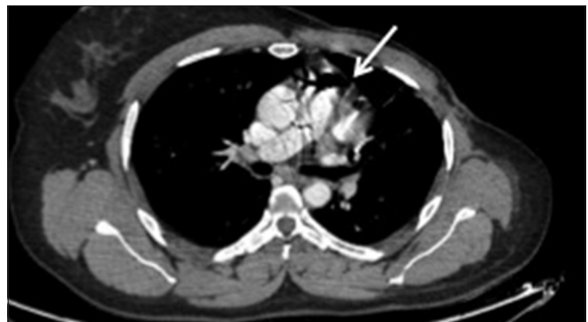
Figure 1: Axial multiplanar reformatted (MPR) image showing air in the main pulmonary artery (arrow)