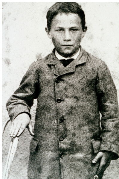
Figure 6. Joseph Meister in 1885, the first human to have received Pasteur's live, attenuated rabies vaccine on July 6, 1885.

Vulpian. The first injection was derived from the chord of an inoculated rabbit which died of rabies on 21 June (15 days earlier) [92]. Over the 10 following days, Joseph Meister received 12 additional doses of attenuated and progressively more virulent virus to quickly generate an immune response, in an attempt to beat the virus in a deadly race against time [19,33,72]. Meister survived.