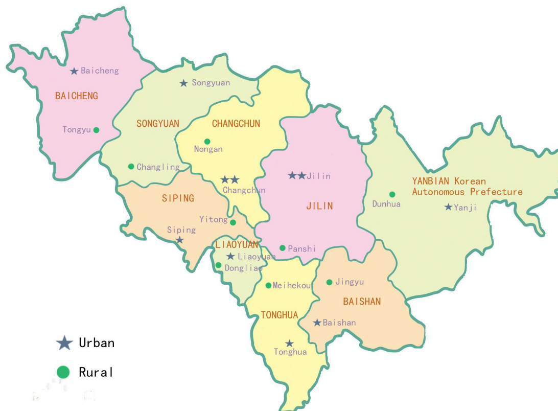
Figure 1 Geographic distribution of hospitals throughout the Jilin province.