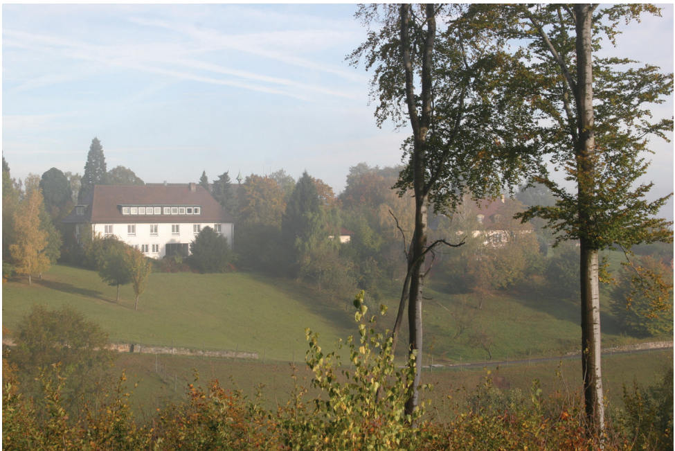
Figure 1. View of the venue of the meetings of the German-speaking coleopterists, Landgut Burg vicinity of Beutelsbach, 24.10.2009, southwest Germany (near Stuttgart,).