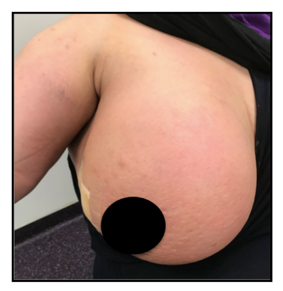
Figure 1. Photograph of an inflammatory breast cancer case with typical "orange skin".

axis, then we review the accumulating evidence about the role of IL-17 in BC, and finally we discuss whether it could be used as a therapeutic target in clinical practice.