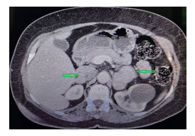
Figure 1: Abdominal computed tomography image showing the bilateral adrenal masses (arrows).

After recovery, the patient was transferred to the urology ward and discharged without complication 3 days later. Histopathological findings showed a nested and solid pattern outlined with sustentacular cells. The tumoral cells were large and polygonal with abundant fine granular red-purple cytoplasm. The nuclei showed vesicular with variation in size and prominent nucleoli. There was no atypia, necrosis, or mitosis. The diagnosis of pheochromocytoma was confirmed morphologically (Figure 3). Postoperatively, the replacement corticosteroid therapy with hydrocortisone and later with fludrocortisone was initiated with gradual dose titration. The patient remained clinically stable in the follow-up period with a significant reduction in urinary metanephrines levels.