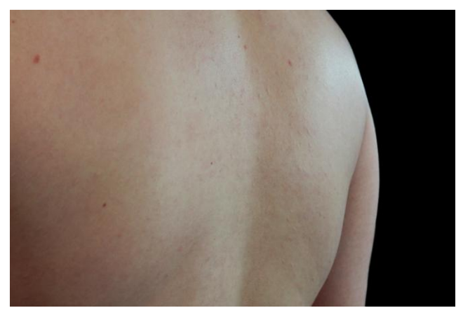
Figure 2: Anetoderma (case #2)

On examination, we observed skin-coloured sac-like herniated lesions with a size of up to 7 mm arranged along Langer's lines (Figure 2).