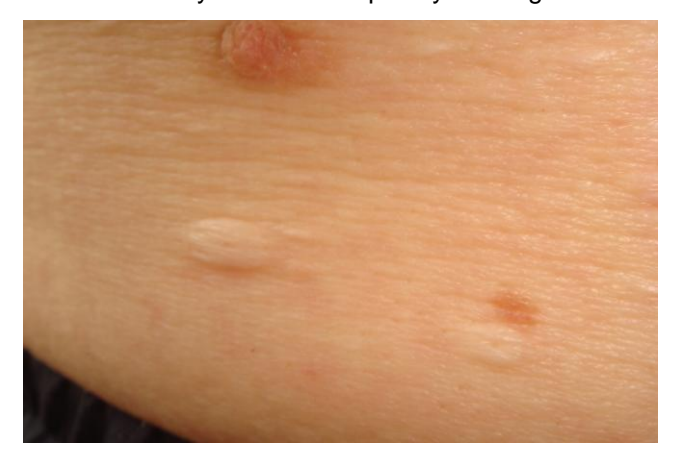
Figure 1: Anetoderma (case #1)

dermis. In the upper dermis, there was a focal loss of elastic fibres. The skin appendages were preserved. An inflammatory infiltrate completely missing.