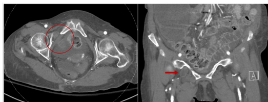
Figure 1 CT angiogram showing a right-sided obturator hernia in axial (red circle, left) and coronal (red arrow, right) views.

Total extraperitoneal (TEP) repair and transabdominal preperitoneal (TAPP) repair facilitate bilateral obturator, femoral, and inguinal hernia repair