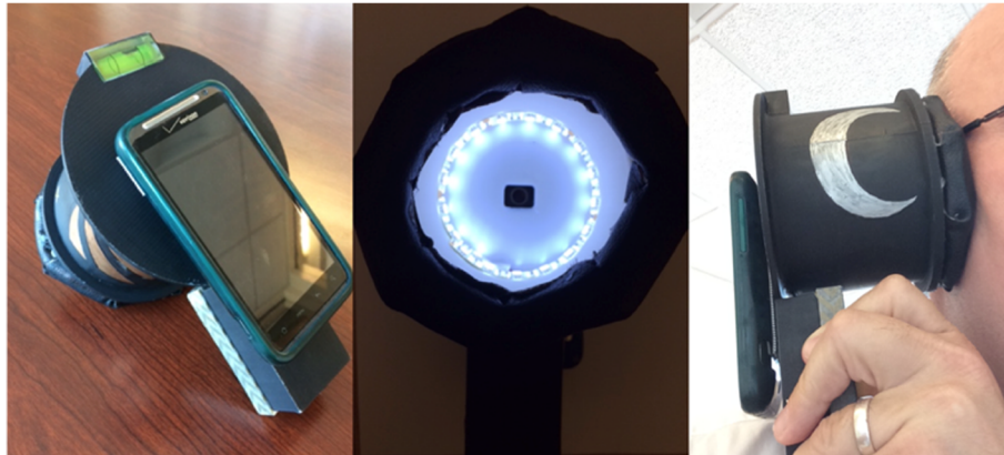
Fig. 2 This figure shows the image stabilization device (the Donut). The leftmost image shows the back of the Donut, where the phone is attached. The bubble level is mounted on the top of the back of the Donut to control for angle rotation during image capture. The middle image shows looking into the Donut, the LED strip is laid along the inner base of the Donut. The right image demonstrates use of the Donut. The phone is mounted on the left, while the Donut interfaces with the participant on the right

The participant visited the first study coordinator, where two images of their left ear were captured (one with the Donut and one without). These two images taken under identical ambient light, were designated ‘first visit’ images for the corresponding datasets (with and without Donut). The participant then walked to the second study coordinator where the process was repeated – designating ‘second visit’ images for the corresponding datasets (with and without Donut). A total of four images of each participant’s left ear were collected - two images taken with the Donut (first and second visit images), and two images taken without the Donut (first and second visit images).