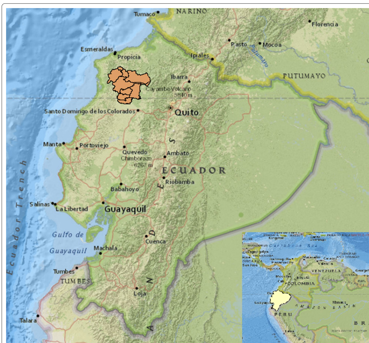
Fig. 1 Map of the study area in the district of Quinindé, Esmeraldas Province, Ecuador

13 months, 49.0% at 2 years, 65.7% at 3 years, and 81.0% at 5 years (Fig. 2). Distributions of potential risk factors and frequencies of Toxocara spp. seropositivity at 2, 3 and 5 years are shown in Table 1. Overall crude and adjusted associations with potential risk factors over the observation period are shown also in Table 1. Variables significantly associated with seroprevalence in adjusted analyses were: age [Odds ratio (OR) 2.06, 95% confidence interval (CI) 1.66–2.56, P < 0.001 ], male sex (female vs. males, OR 0.66, 95% CI 0.48–0.89, P = 0.006 ), maternal ethnicity (non-Afro-Ecuadorian vs. Afro-Ecuadorian, OR 0.65, 95% CI 0.47–0.91, P = 0.011 ), lower maternal