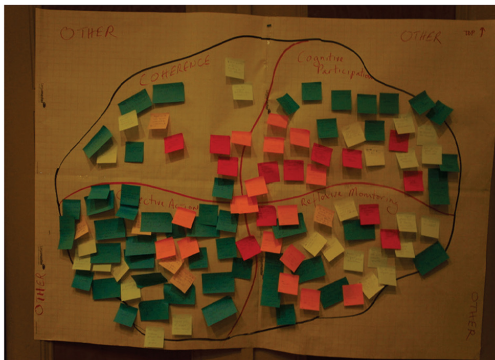
Each “sticky” notelet corresponds to an item of verbal data identified from the interactive role play discussion