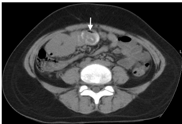
Fig. 4 Axial oral contrast-enhanced computed tomographic scan of abdomen demonstrating the telescoping of the jejunal loops suggestive of jejuno-jejunal intussusception (white arrow) with thickening of adjacent jejunal loops.