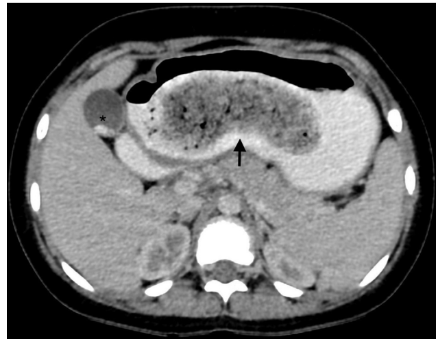
Fig. 2 Axial oral and intravenous contrast-enhanced computed tomographic scan of abdomen demonstrating a heterogeneous density lesion (black arrow) within the lumen of stomach with “mottled” appearance and clearly outlined by intraluminal oral contrast coincidental gall bladder calculi (asterisk).