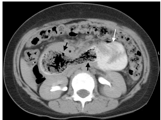
Fig. 3 Axial oral and intravenous contrast-enhanced computed tomographic scan of abdomen demonstrating a heterogeneous density lesion (black arrows) within the lumen of duodenum with “mottled” appearance and clearly outlined by intraluminal oral contrast. Note the dilated proximal jejunal loop (white arrow) secondary to the distal jejuno-jejunal intussusceptions and duodenal wall thickening (black asterisk).

A midline laparotomy incision was given, and a duodenojejunal (DJ) junction was noted to the left of the L1 vertebra. Masses were palpated at the stomach and small bowel. Two concealed perforations were pointed out at the DJ junction and 40 cm distal to the DJ junction. Trichobezoar was successfully removed through a separate enterotomy incision at the antimesenteric border of the distal jejunal perforation segment as the perforation site is close to mesentery ( Fig. 6 ). DJ junction perforation was closed using 3–0 silk in two layers. Resection and end-to-end anastomosis were performed at the distal jejunal perforation site. Given trichotillomania, the patient was further referred for psychiatric evaluation. Postsurgical follow-up was uneventful, and no significant complications occurred.