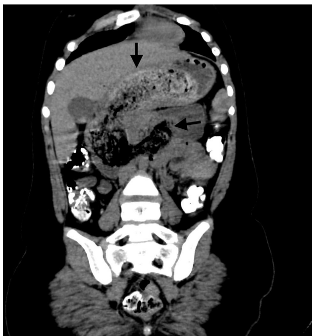
Fig. 5 Coronal multiplanar reformation of oral and contrast-enhanced computed tomographic of abdomen demonstrating the trichobezoar (black arrows) outlined by oral contrast media and contents in the stomach, duodenum, and proximal jejunum.