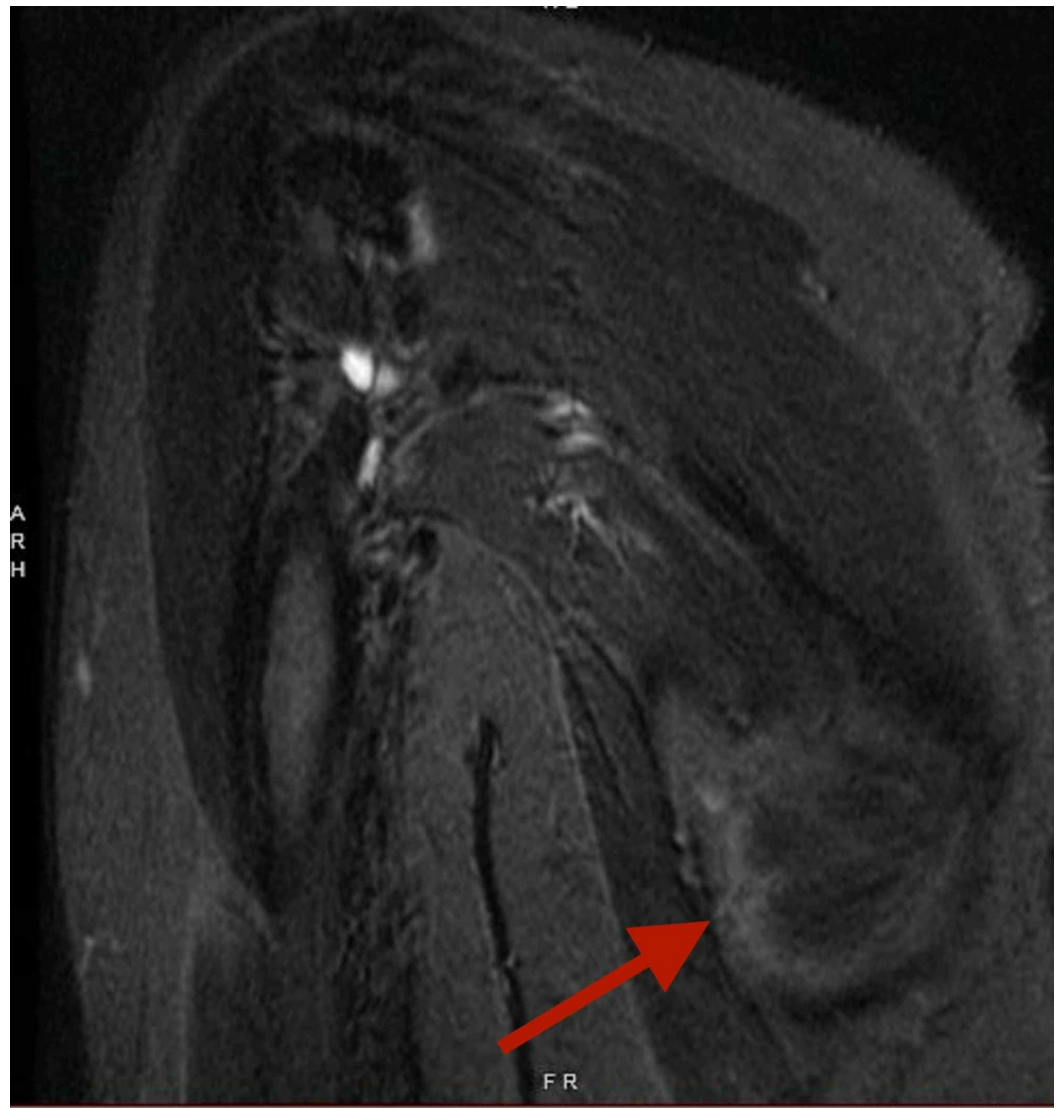
FIGURE 2: Heterogeneously enhancing mass demonstrated along the right posterior lateral chest wall

The patient was evaluated by oncology and at that time, the differential diagnosis included elastofibroma, desmoid tumor, sarcoma, and recurrent lung cancer. A CT-guided biopsy was performed, and the pathology report was consistent with a diagnosis of elastofibroma. The patient's oncologist recommended no surgical intervention of the mass due to its benign nature.