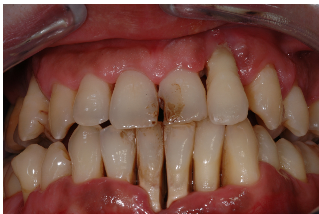
FIGURE 1 Clinical presentation of a 25-year-old Caucasian male patient (cannabis user) with generalized Stage IV, Grade C periodontitis

Recently, Shariff et al 51 published the results of the relationship between frequent recreational cannabis use and periodontitis