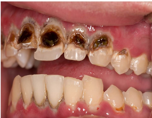
FIGURE 10 Clinical presentation of "meth mouth" in a MDMA user (right side). MDMA, 3,4-Methylenedioxy-Methamphetamine

well known and they are related to sympathomimetic manifestations, in turn caused by the stimulation of the nervous system via the adrenal glands, which increases heart rate and tachypnea via vasoconstriction and bronchodilation, fatal kidney disease, and hyperthermia. 110 The short-term behavioral effects include intensified emotions, euphoria, aggression, talkativeness, increased alertness, insomnia, hyperactivity, decreased appetite, increased respiration and hyperthermia, increased sensory perception, and sense of closeness to other people. 96 The long-term effects include psychological (but not physical) addiction and dependence, sleeplessness, restlessness, hyperactivity, loss of appetite and weight, tremor, and repetitive movements 112 ; paranoia is a long-term effect, which needs years after quitting to be controlled, and it can be worsened by auditory and visual hallucinations. 97 Moreover, chronic methamphetamine use increases aggression and impulsivity and impairs executive functions, causing interpersonal difficulties and leading to a disorganized lifestyle. 110,112 Patients frequently fail to show up for appointments and may be irritable, restless, or anxious during medical treatments.