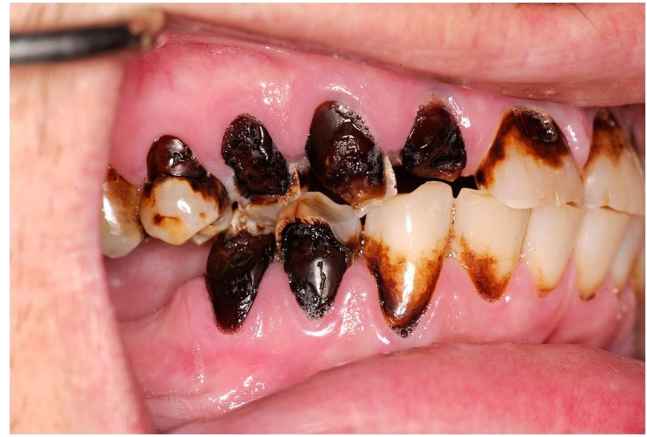
FIGURE 11 Clinical presentation of "meth mouth" in a MDMA user (left side). MDMA, 3,4-Methylenedioxy-Methamphetamine