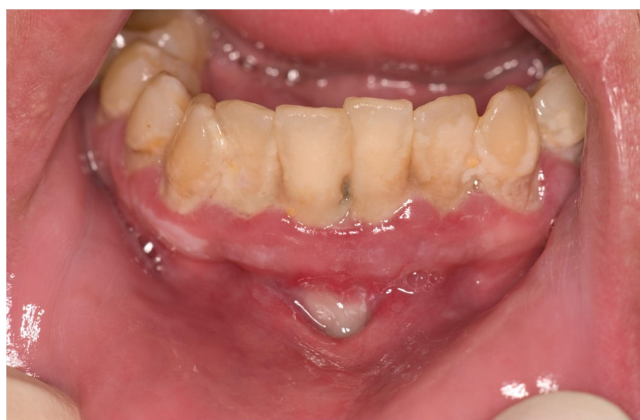
FIGURE 6 Chemical traumatic lesion localized at the level of the mucogingival junction in a crack user

of 120 exposed individuals that were invited to participate were eligible and enrolled. All permanent, fully erupted teeth, excluding the third molars, were probed at six points; combined attachment loss and bleeding on probing were recorded. Mean probing depth value was significantly greater in crack/cocaine-addicted individuals ( 2.84 \pm 0.76 mm) compared with nonaddicted individuals ( 2.55 \pm 0.73 mm, P = .04 ). Although the probing depth was greater in crack/cocaine-dependent individuals, destructive periodontal disease was not associated with the use of crack and cocaine in this population, but was associated with higher dental plaque index and older age.