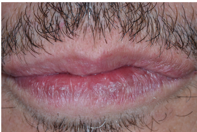
FIGURE 8 Clinical presentation of a patient (MDMA user) with cheilitis related to poor nutrition. MDMA, 3,4-Methylenedioxy-Methamphetamine

Gantos et al 109 divided the medical general effects of methamphetamine use into two main groups: behavioral/psychological changes and poor nutrition. The behavioral/physiologic effects of MA are