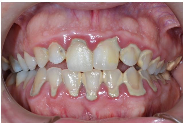
FIGURE 3 Clinical presentation of a 20-year-old Caucasian male patient with plaque-induced gingivitis and cannabis-induced gingival enlargement

The statistical logistic regression analyses were adjusted for age, gender, paternal income, paternal education, frequency of tooth-brushing, and time since last dental visit. The results showed no association between "Ever use of cannabis" and combined attachment loss \geq 3 mm where nonsmokers (odds ratio = 0.95), occasional smokers (odds ratio = 1.15), or daily tobacco smokers (odds ratio = 0.98) were concerned. Similarly, there was no evidence for any association between "regular cannabis use" and combined attachment loss \geq 3 mm irrespective of the tobacco smoking category. When analyses were adjusted for the effects of all the covariates, all but one odds ratio estimate indicated a negative association between cannabis use and the presence of necrotizing ulcerative gingivitis. An inverse