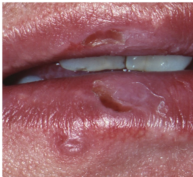
FIGURE 7 Chemical traumatic lesion of the lip caused by crack use

Recently, some authors quantified, through real-time PCR, the presence and counts of Aggregatibacter actinomycetemcomitans , Prevotella intermedia , Porphyromonas gingivalis , and Fusobacterium nucleatum in crack users and nonusers. 87 A cross-sectional study was conducted involving 74 crack cocaine users and 81 nonusers matched for age, gender, and tobacco use. Demographic and clinical variables were analyzed. Subgingival bacterial samples were collected from four sites with the greatest probing depths and