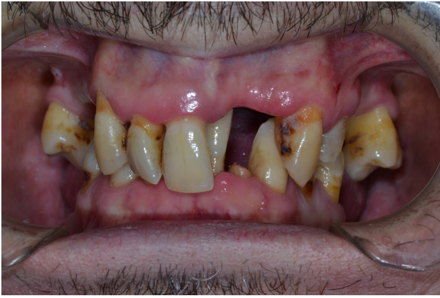
FIGURE 9 Clinical presentation of a patient (MDMA user) with generalized gingival recessions and abrasions. MDMA, 3,4-Methylenedioxy-Methamphetamine