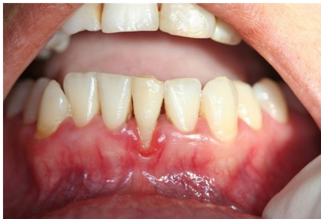
FIGURE 5 Clinical presentation of a patient with deep narrow recession and bone dehiscence on the lower left central incisor induced by cocaine use