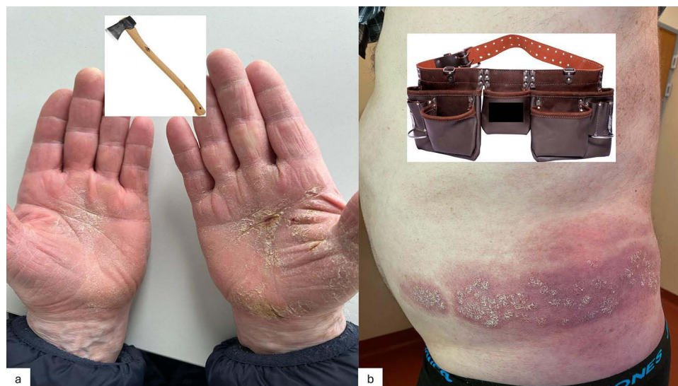
Figure 2 Clinical cases responding to the Köbner effect whilst on biologicals with stable remission. Case 2 (a): woodchopping with a heavy axe, inducing palmar psoriasis. Case 4 (b): wearing a heavy toolbelt inducing a belt-like psoriasis.