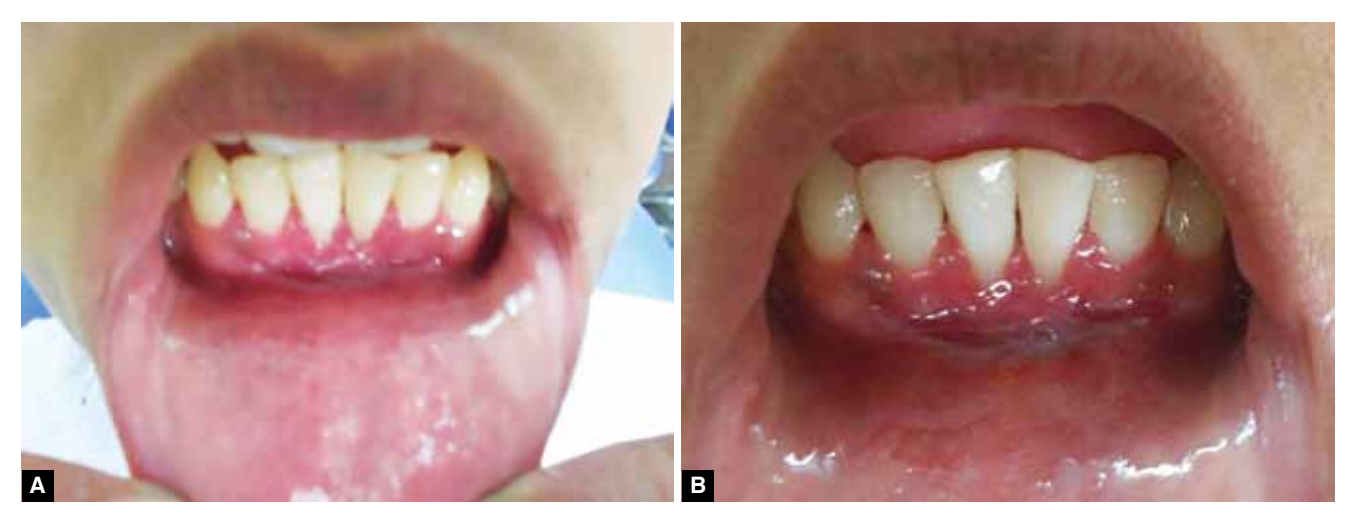
Figs 3A and B: (A) Photograph after 15 days and (B) follow-up photograph after 1 year

two categories: occlusal discrepancies and nonocclusal factors.<sup>2</sup> Occlusal factors include anterior teeth crowding and nonocclusal factors include superior attachment of inferior labial frenum. Most surgical procedures require denuded bone or root surface for correcting gingival recession.<sup>6</sup> However, in pediatric patients there is no denuded bone or root; thus, the emphasis is on halting a potentially destructive process rather than trying to get an area recovered with tissue.