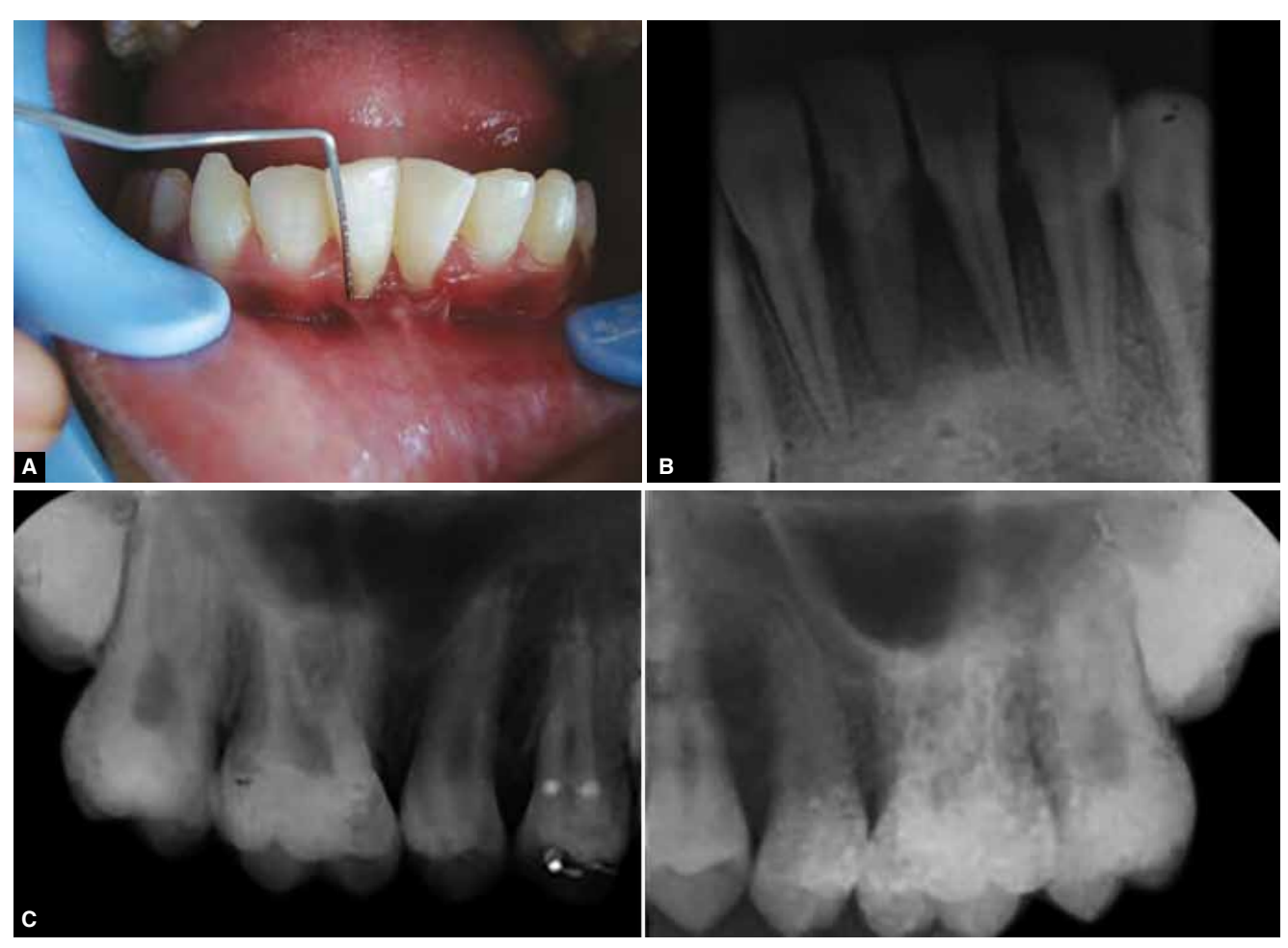
Figs 1A to C: (A) Intraoral photograph showing insufficient sulcus depth and high frenum attachment, (B) intraoral periapical radiograph of 31 and 41 showing mild interdental bone loss and (C) intraoral periapical radiograph of maxillary molars to rule out aggressive periodontitis

Vestibular Extension along with Frenectomy in Management of Localized Gingival Recession in Pediatric Patient