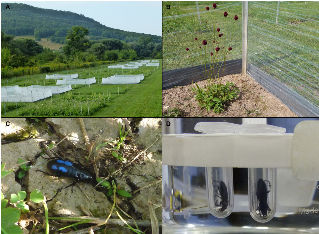
Fig 1. Setup of field experiment and regurgitate sampling. (A) Overview of plots of the Trait-Based Experiment with enclosures. (B) Enclosures were made of construction foil sunk into the soil using PVC panels. (C) Marked beetles were released and recaptured to sample regurgitates (D) sampling regurgitates.