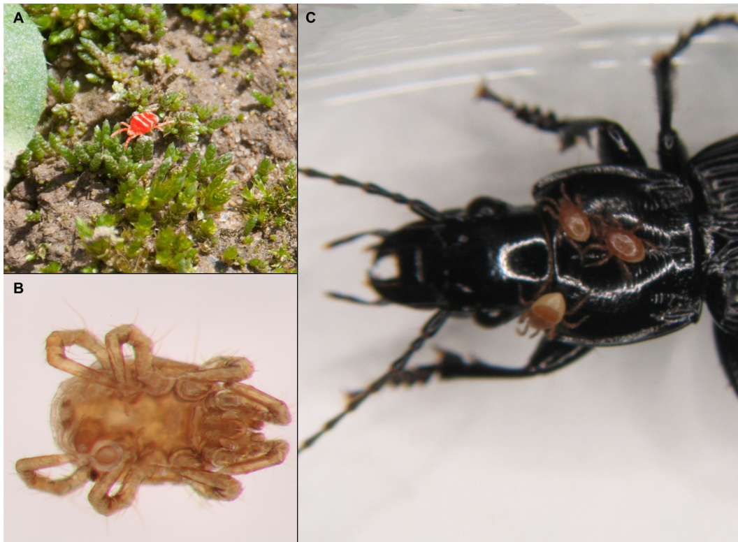
Fig 4. Mites as prey and parasites of P. melanarius . (A) Predatory mite (Trombidiformes: Trombiculidae) in a plot of the Jena-Experiment. (B) Mite isolated from a gut of P. melanarius (C). Phoretic mites (Mesostigmata: Parasitidae) on P. melanarius . Photographs by C. Scherber.