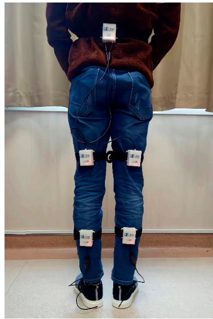
Figure 1. Photograph of JiBuEn gait-analysis system.